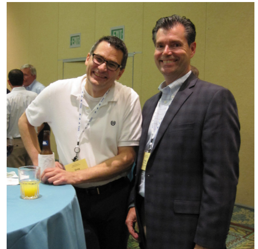
Meet and Mingle