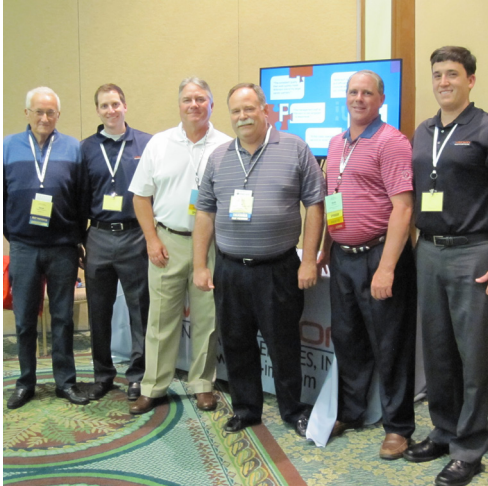
Wilkinson Insurance Services