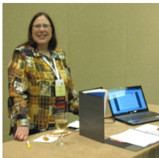
Premium Audit 101