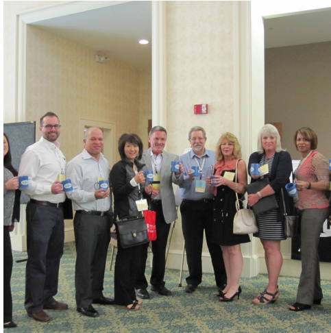
First Time Attendees