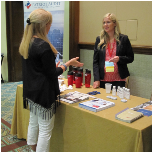
Patriot Audit Services