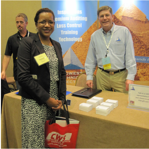
Midwest Technical Inspections