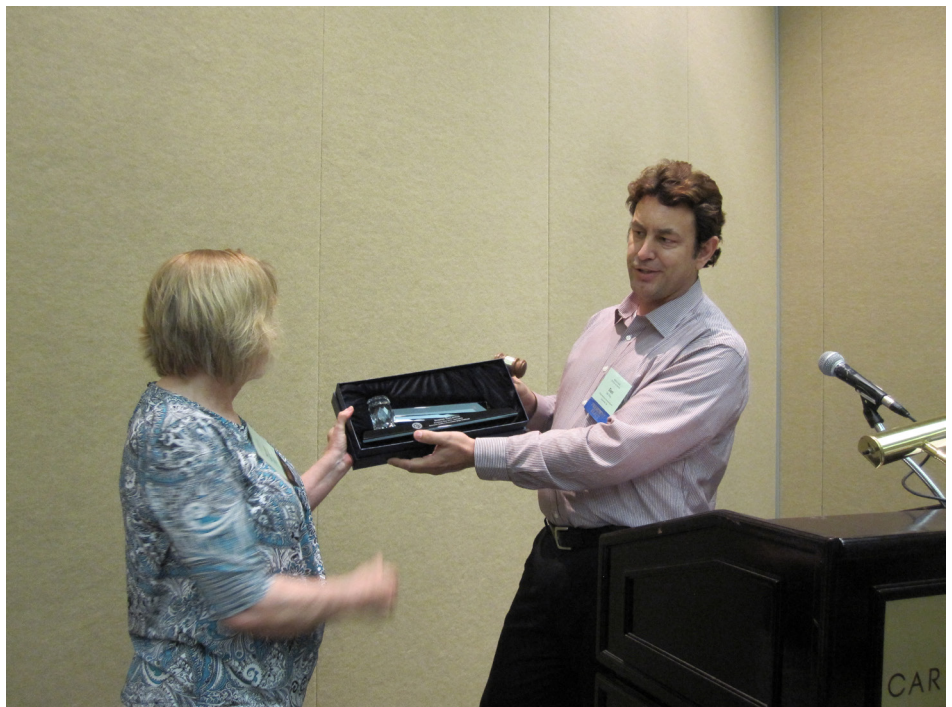
IAASE President's Gavel