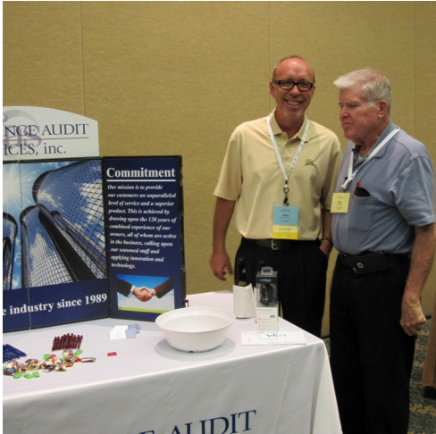
Insurance Audit Services, Inc.