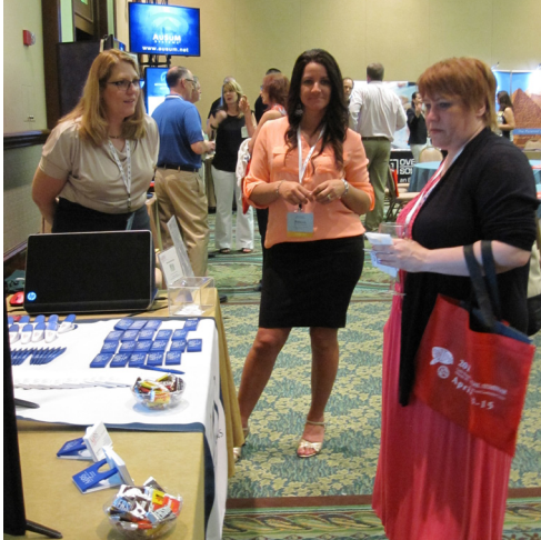
Automated & Management Solutions