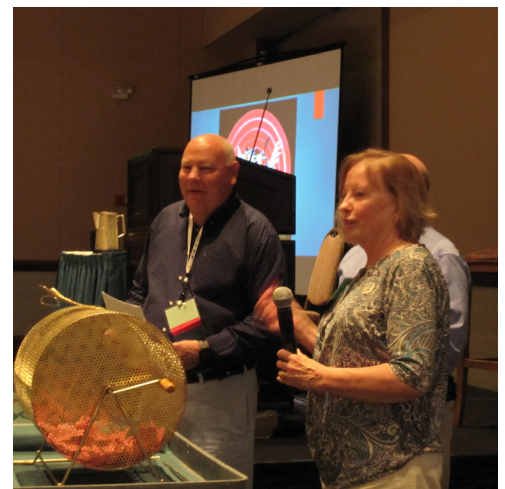
Announcing the 50-50 Winner