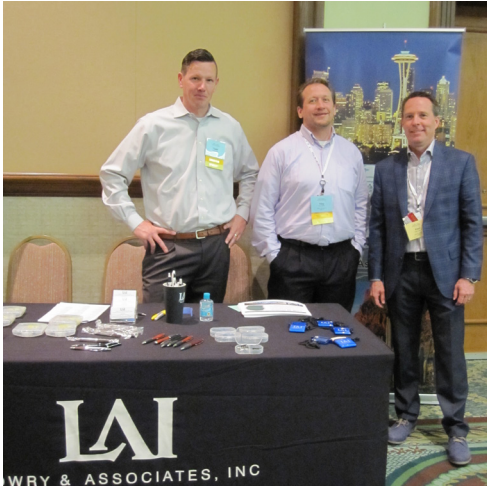
Lowry And Associates