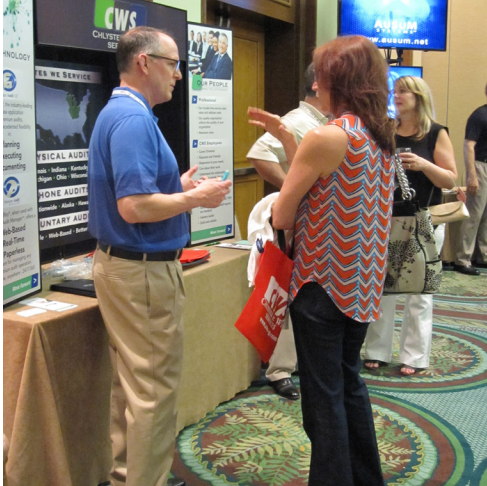
Chlystek and White Services