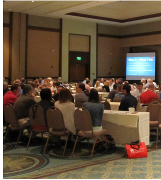
Let's Talk Session